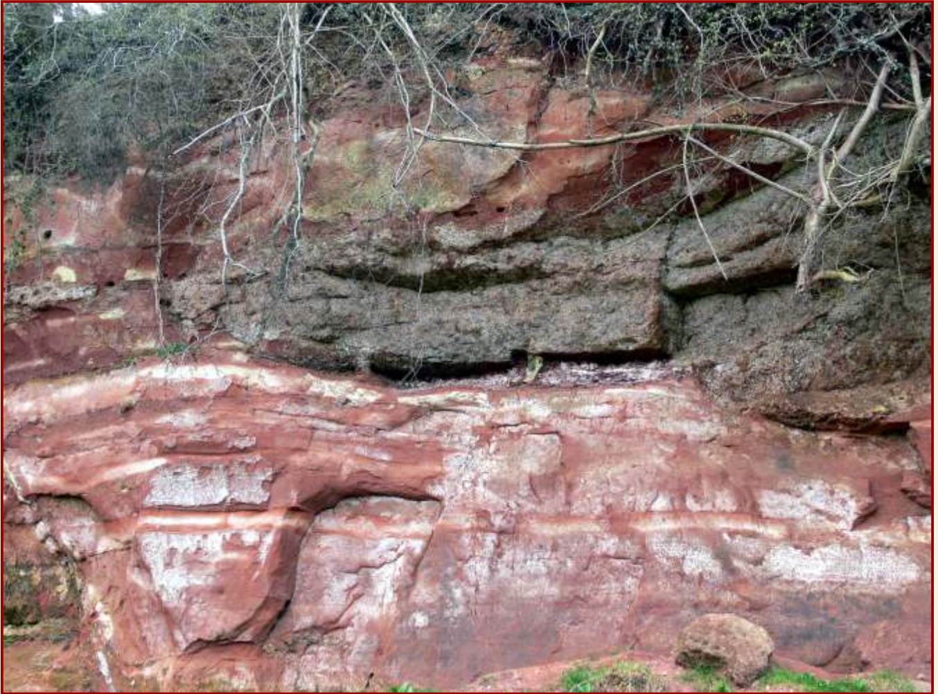
The darker deposit in the centre right of the photograph at Belah Scar is a 'Brockram' which is a breccia bed and is a fan that was deposited by a flash flood that swept down from high ground to the south.