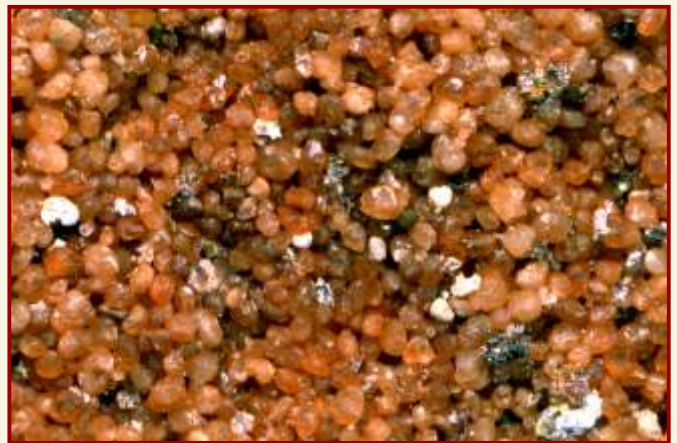
A close-up image of Penrith Sandstone which is an aeolian deposit where the 'millet seed' grains display a remarkable degree of rounding.